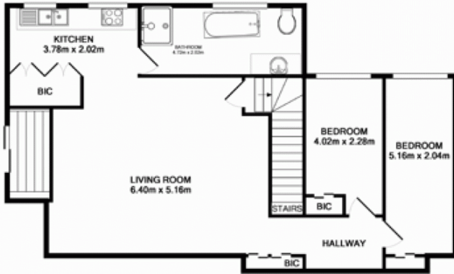
BASEMENT LEVEL APPROX. FLOOR AREA 83.9 SQ.M. (903 SQ.FT.)