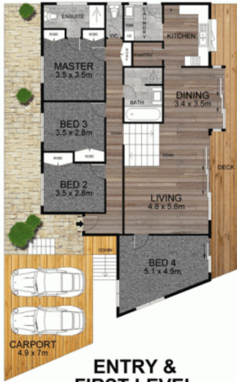
ENTRY & FIRST LEVEL