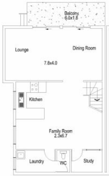
Lower Ground Level