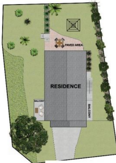
GENERAL SITE PLAN (NOT TO SAME SCALE)

All information contained herein is gathered from sources we consider to be reliable. However we cannot guarantee or give any warranty about the information provided and interested parties must solely rely on their own enquiries. General Site plan is approximate only and shows a general layout of the land.